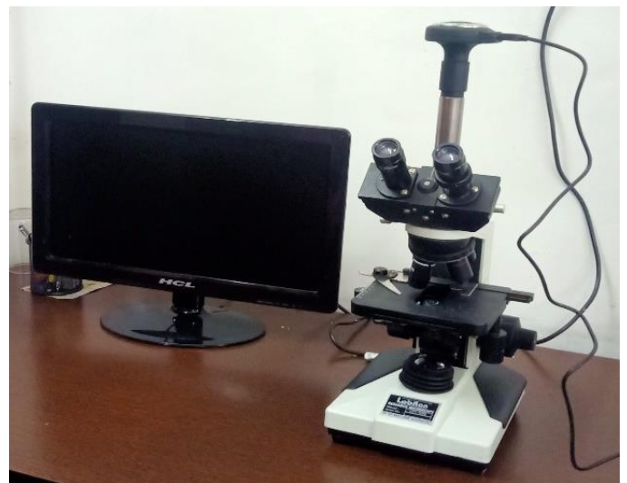
Trinocular Microscope with Camera