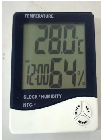
Humidity and Temperature Meter