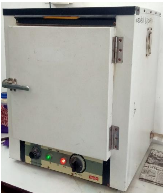
Hot Air Oven